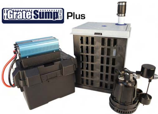
GrateSump Plus (2400GPH)