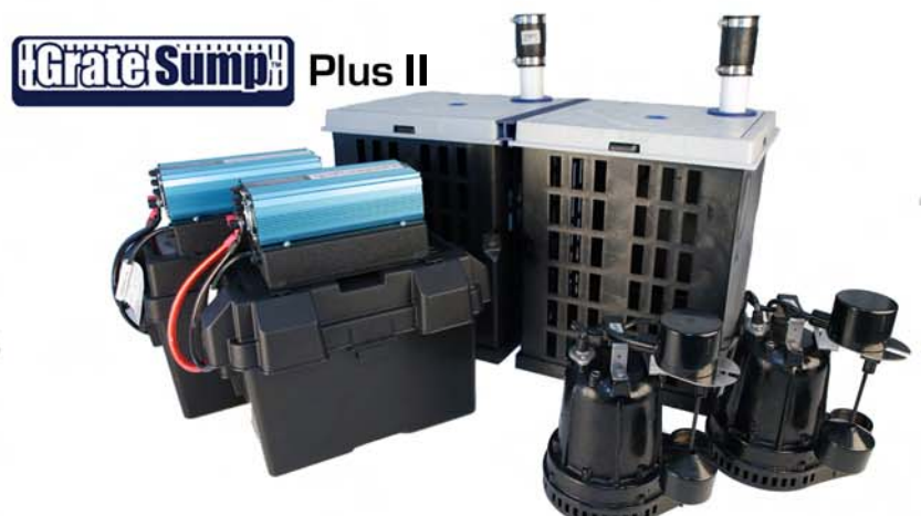
GrateSump Plus II (4800GPH)